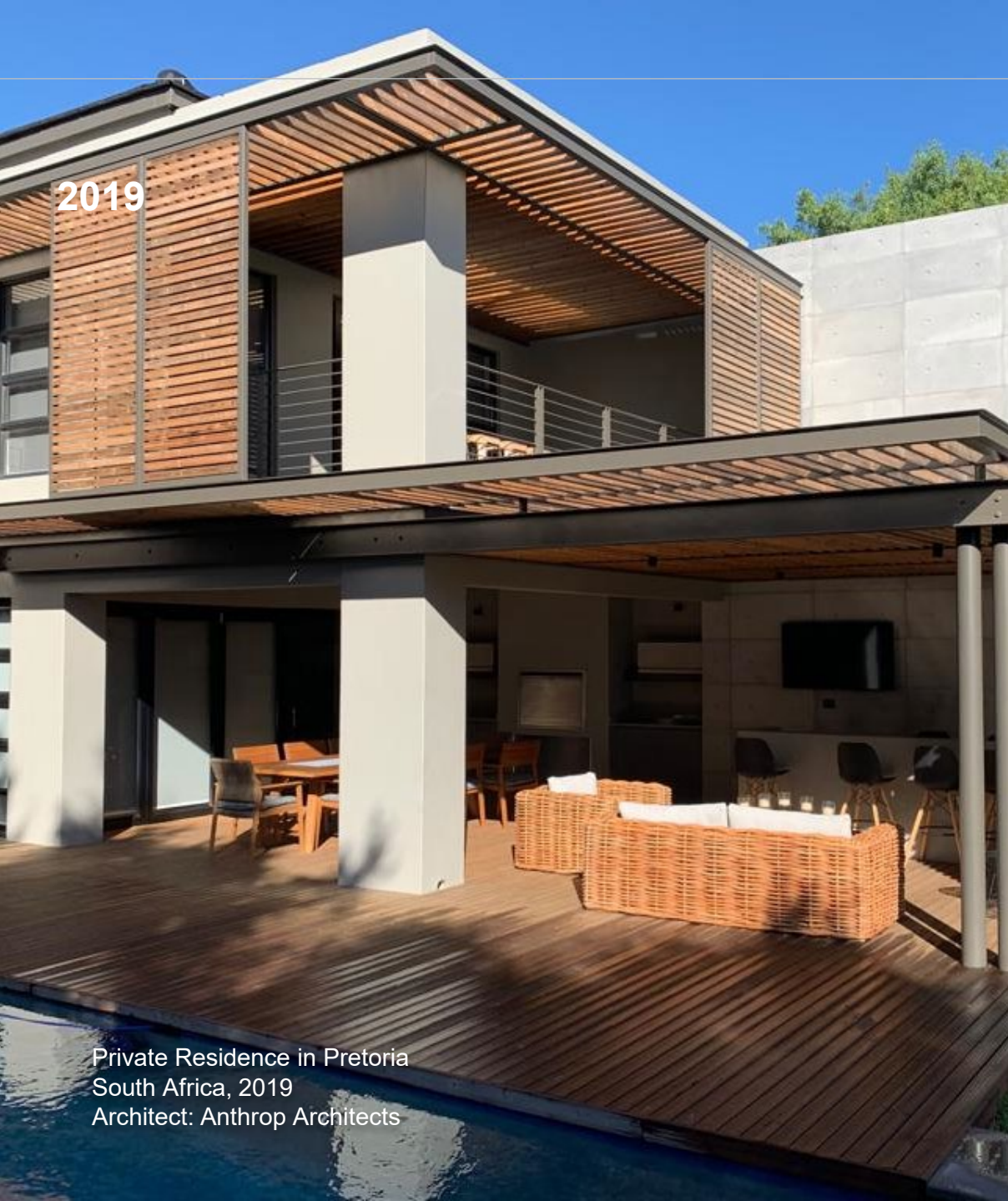
Private Residence in Pretoria South Africa, 2019 Architect: Anthrop Architects