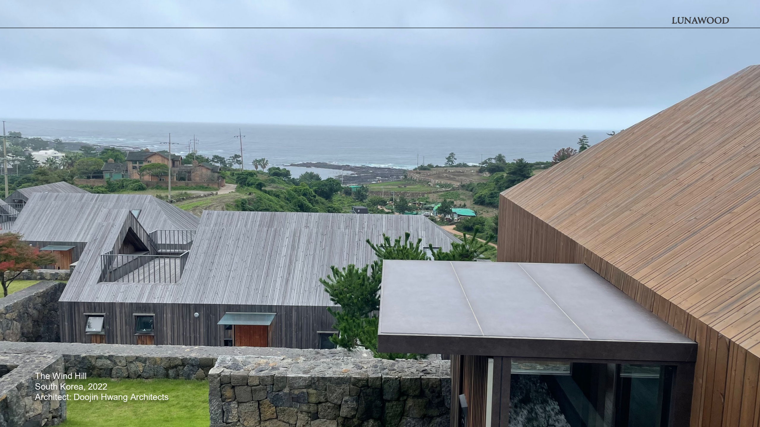
The Wind Hill South Korea, 2022 Architect: Doojin Hwang Architects