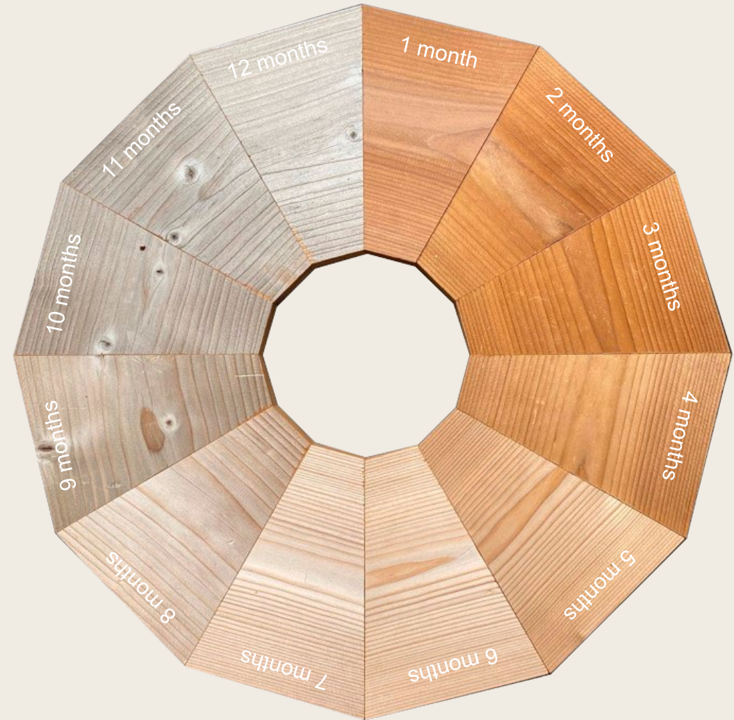
12 months of natural greying in Finland