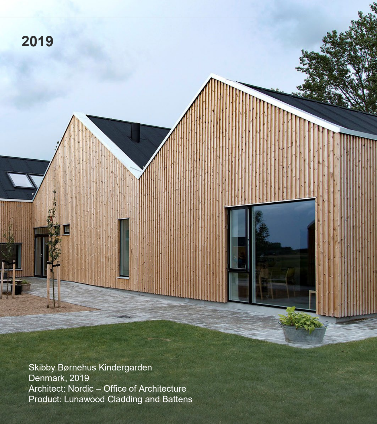
Skibby Børnehus Kindergarten Denmark, 2019 Architect: Nordic – Office of Architecture Product: Lunawood Cladding and Battens