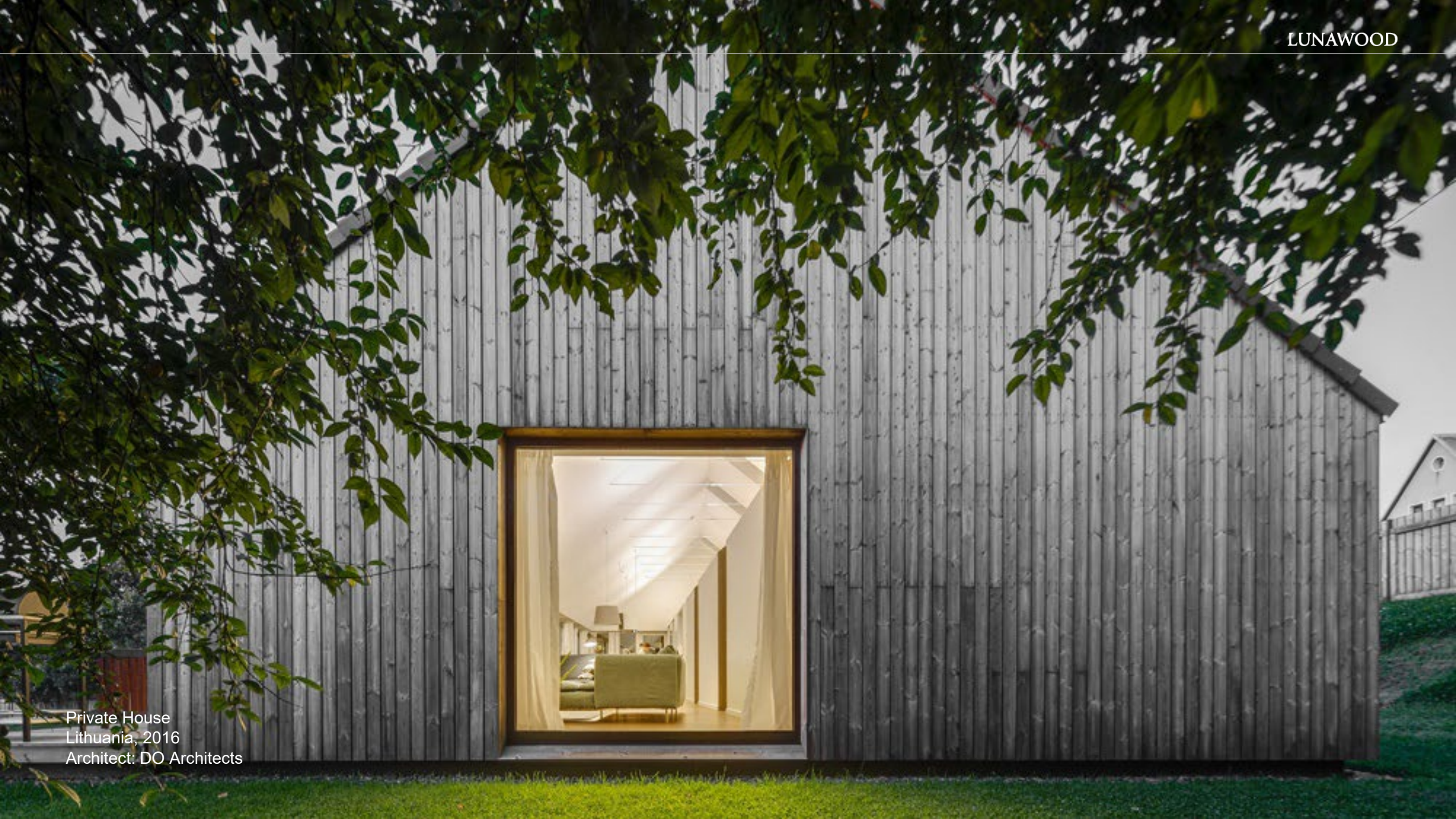
Private House Lithuania, 2016 Architect: DO Architects